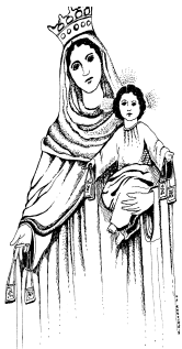
Our Lady of Mount Carmel

If you are visiting or new to our community, we are blessed that you are here to worship with us and we welcome you. Our Pastor, Retired Priests and Parish Family extend the hospitality of Jesus Christ to you.